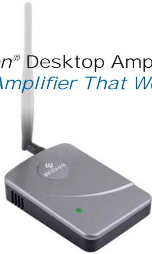
Wilson Electronics Desktop In-Building Cellular/PCS Amplifier Part# 801247

Wilson® Desktop Amplifier "The Amplifier That Works!"