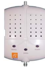
Wi-Ex™ in-Building Cellular/PCS Amplifier PN: YX510-PCS-CEL

Wi-Ex™ In-Building Amplifier "Less Power 1 than a Cell phone!"